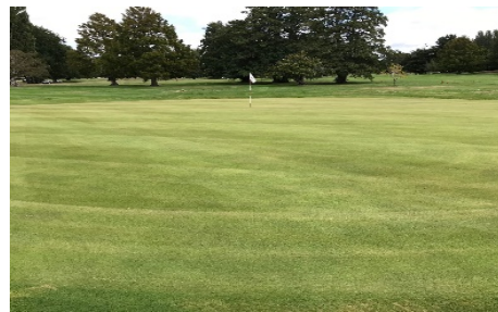
The 18th Green on Friday 12th